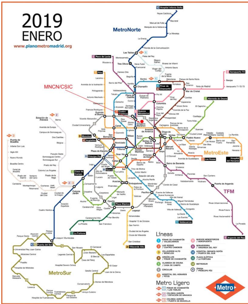
Map of the metro of Madrid. [ ● location of MNCN/CSIC]